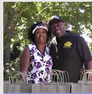
Love Bird Golfers