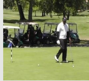
Practice makes Perfect