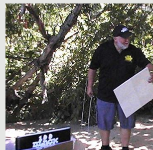
Member and Friend of the 100