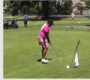
Golf is for Everyone