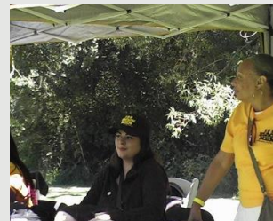
The Heart of the Tournament