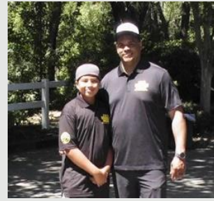
The future of the 100