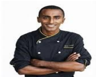
Chef Marcus Samuelsson Top Black Chef Award - 3 Chefs dinners