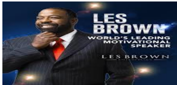
Les" Brown the national known motivational speaker