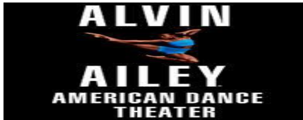
Alvin Ailey American Dances performed twice

The 100 BMOSC has as part of our charter a commitment to cultural enrichment. We believe that by provide opportunities to art of all types, different cultural events and performances, and sporting events members of our community may have an experience to which they may not have without our support.