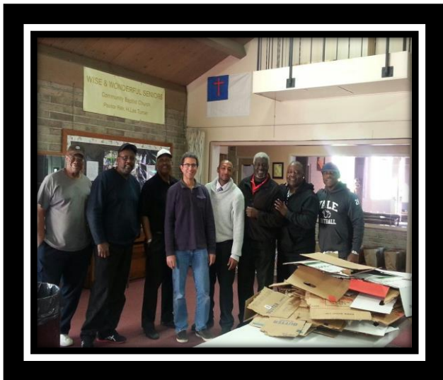
Thanksgiving Meals at Community Baptist Church in Santa Rosa

As part of the 100 Black Men of America Inc. (National Organization) traditions, all new members are asked to wear the 100 lapel pin while in public. The pinning ceremony is a symbolic welcoming of all new members into the 100 Brotherhood. New members are pinned by the President in front of the membership.