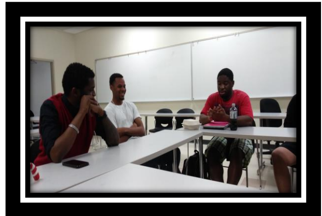
SSU Mentoring Group