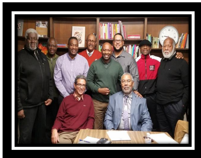
100 Black Men Members