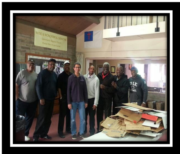
Thanksgiving Meals at Community Baptist Church in Santa Rosa